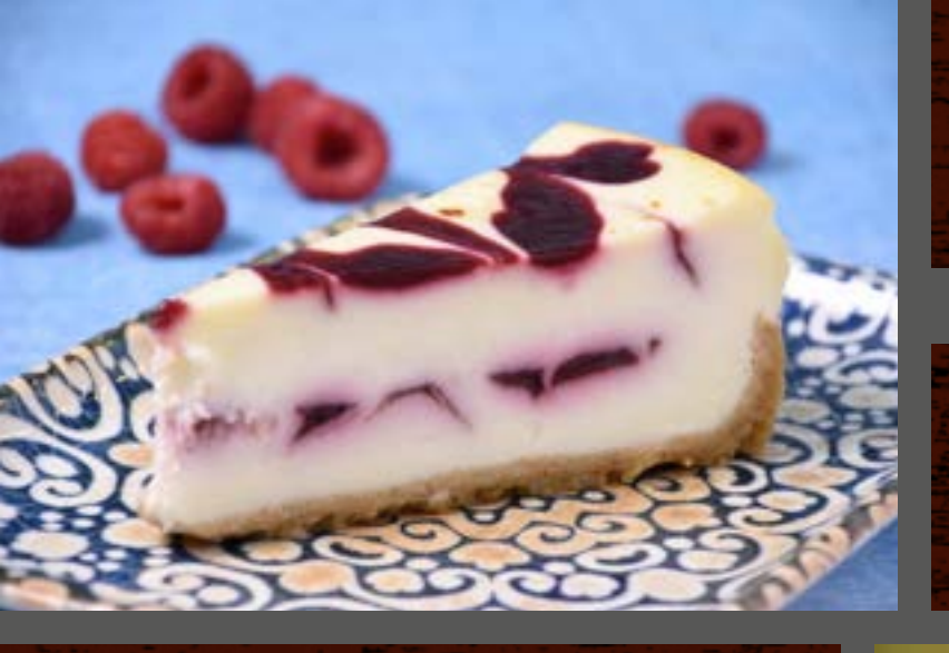
Raspberry Cheese Brulee (Lampone)